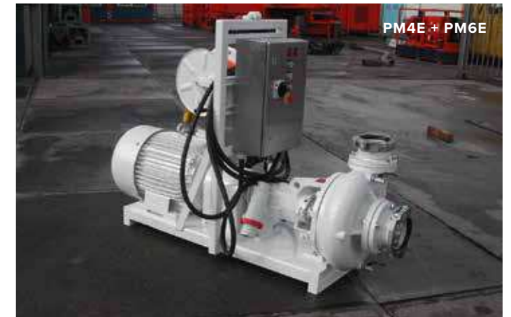
PM4E + PM6E