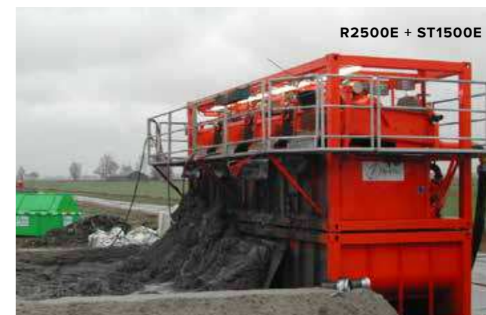
R2500E + ST1500E