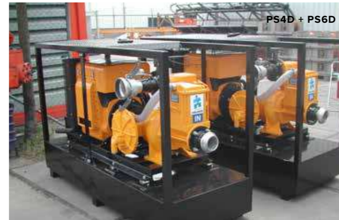
PS4D + PS6D

CE certification of conformity as well as full manual is included, and system is sandblasted and painted in 2-component RAL colour of choice (non-metallic).