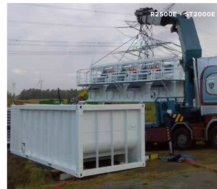
R2500E + ST2000E