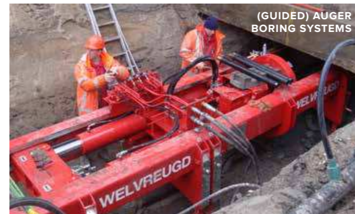
(GUIDED) AUGER BORING SYSTEMS