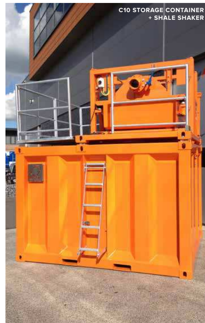
C10 STORAGE CONTAINER + SHALE SHAKER

CE certification of conformity as well as full manual is included, and system is sandblasted and painted in 2-component RAL colour of choice (non-metallic) including inside of the tanks.